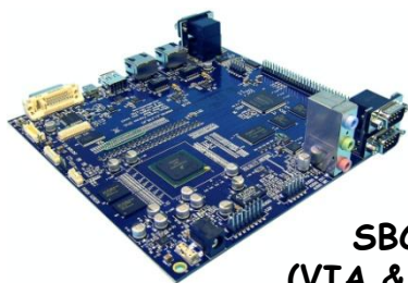
SBCs (VIA & STx)

STx’s original reference designs are available for customization and quick turn manufacturing!