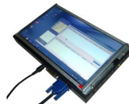
LCDs, Monitors & Systems