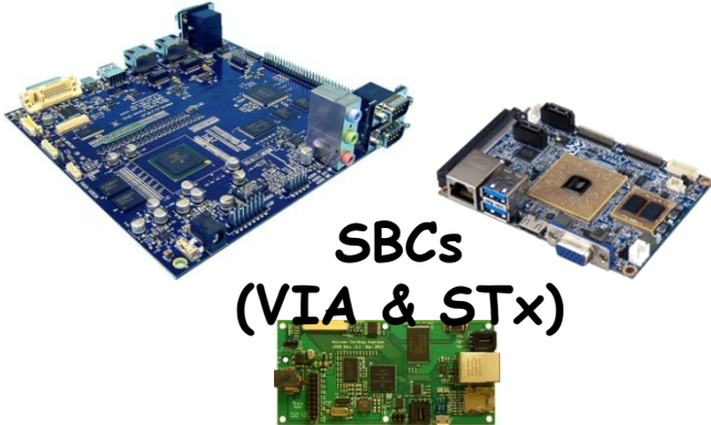
SBCs (VIA & STx)

STx’s original reference designs are available for customization and quick turn manufacturing!