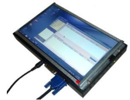
LCDs, Monitors & Systems