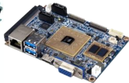
SBCs (VIA & STx)